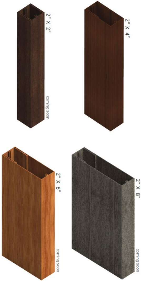
FIGURE 3—EXTRUDED BATTEN CROSS-SECTIONS