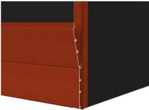
FIGURE 1—TYPICAL WALL PLANK INSTALLATION

ARCHITECTURAL FABRICATION, INC. 2100 E. RICHMOND AVENUE FORT WORTH, TEXAS 76104 (817) 926-7270 www.Arch-Fab.com