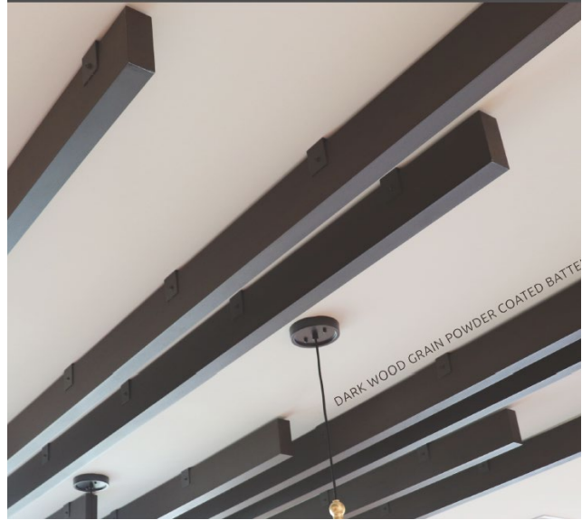
FIGURE 4—CONTINUOUSLY SUPPORTED BATTEN