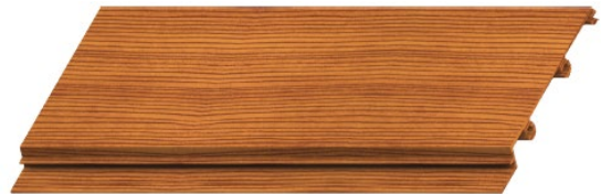
FIGURE 2—EXTRUDED WALL PLANK CROSS-SECTIONS